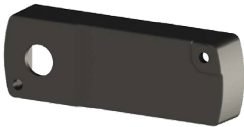
Flush Fit Clamp Box