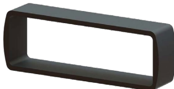
Surface Mount Sleeve